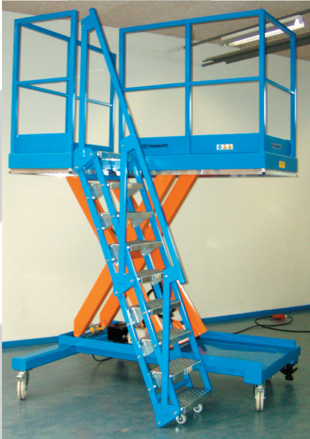
Platform extension flap.