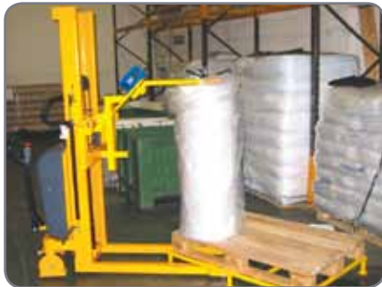
The reel rotator – an ideal alternative when lifting and turning reels.