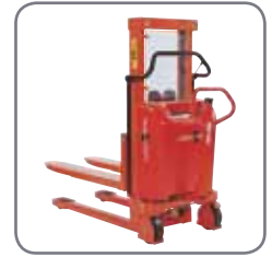
When using a Logiflex without straddle legs, the reel to be handled has to be placed on a pallet.