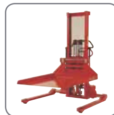
Optional extras, e.g. platform, reel rotator and drum turner.