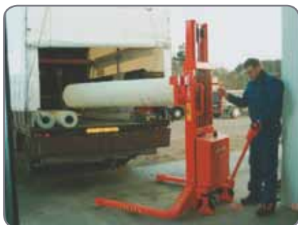
A straddle Logiflex handles reels from a stock to a lorry.