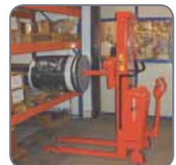
The boom in a stock area.