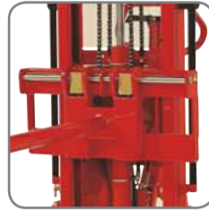
Quick shift makes it easy to replace the boom by other optional extras or forks.

Strong construction ensures a long operating life and low maintenance costs.