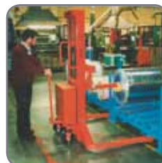
The boom in the packaging industry.