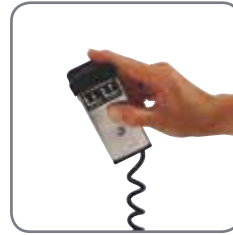
The lifting/lowering function of the electric Logiflex models can be operated by remote control (optional extra).