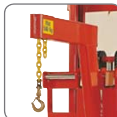
The chain is adjustable, and can easily and quickly be adjusted.