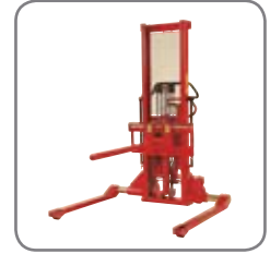
Logitrans offers a wide range of optional extras, e.g. spear, platform, reel rotator and drum turner.