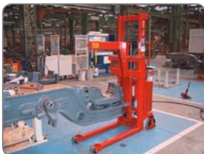
The crane arm in a company, manufacturing train components.