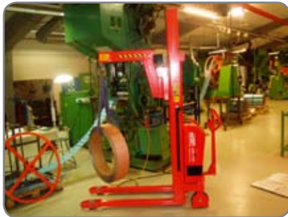
The crane arm in the component industry.