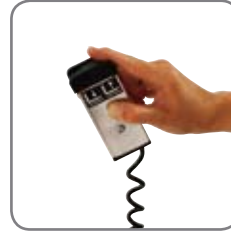
The lifting/lowering function of the electric Logiflex models can be operated by remote control (optional extra).