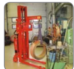
Metallic reels are lifted into a punching machine.