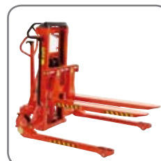
Available for all Logiflex models with adjustable carriage.