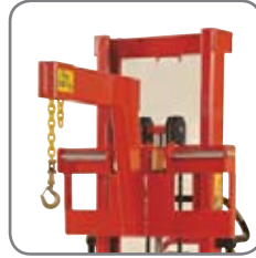
Quick shift makes it easy to replace the crane arm by other optional extras or forks.

Strong construction ensures a long operating life and low maintenance costs.