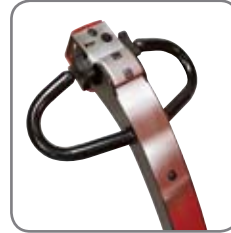
Possible to operate with the handle upright. Central location of all control buttons.