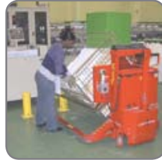
Available with Rotator and/or optional extras, e.g. drum turner, remote control, level control, built-in charger.

Strong construction ensures a long operating life and low maintenance costs.