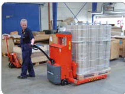
Optimum safety through transparent and impact-resistant safety screen and reduced driving speed in raised position.