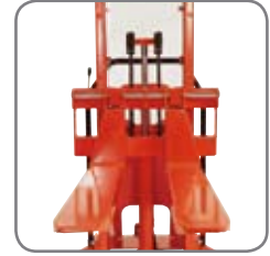
Adjustable forks are available in many different lengths and types.